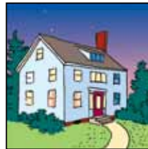
... or home